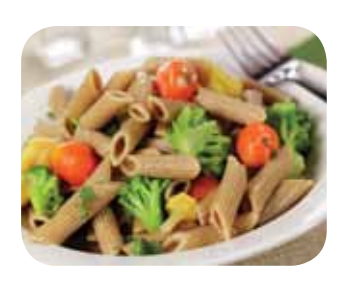
Eat the right amount of calories for you